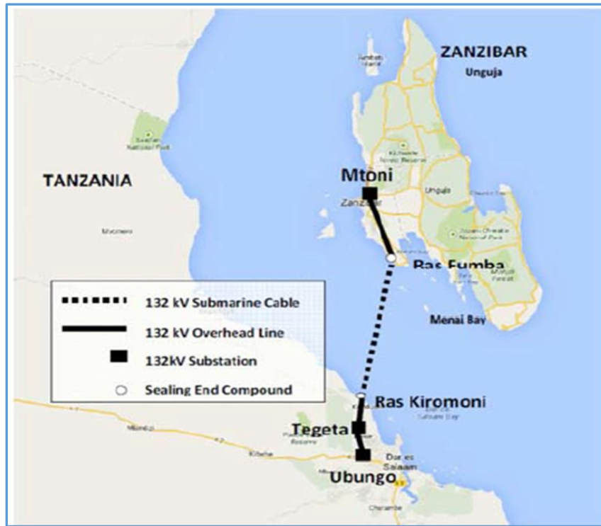
Figure 1.1: 132kV Unguja submarine interconnection

11. In December 2009, Unguja experienced island-wide blackout lasting 3 months due to a fault on the submarine cable. This followed a month-long blackout in May 2008, due to a wide area grid failure on the TANESCO grid. The extended blackouts had an immense negative impact on the island’s economy. Although the new submarine cables on Unguja and Pemba have improved reliability of supply, the risk of supply outages remains due to dependence on a single submarine cable. As a partial mitigation against this risk, ZECO owns 25MW of grid-connected back-up diesel generators on the Island at Mtoni sub-station. These however, have not been adequately maintained over the past years and are considered very expensive to even run as stand-by.